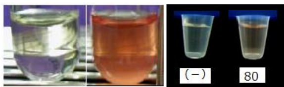
Normal Hemolysis 80mg/dL normal Hemolysis 80mg/dL

* To avoid influence of blood (high lipid or hemolysis, etc.), if your original samples have heavy chyle or hemolysis as the pictures below, do not use them for assay. Abnormal value might be obtained with hemolysis above 80mg/dL with this kit.